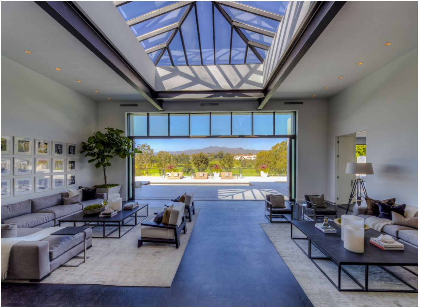
Douglas Elliman Real Estate

The home has an open floor plan and two huge living room areas.